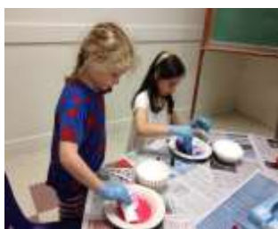
Club J Missions Kids at Clarion Assisted Living and TABLE