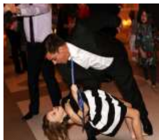
Father-Daughter Valentine's Dance, February